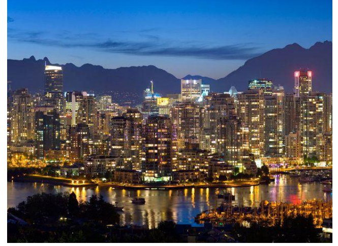
Taipei, September 18 - 22, 2016