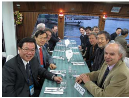
Invited Speakers and Committee Members on Dinner Cruise

This meeting paved the way for the exchange of new scientific information with 10 symposia in the areas of PTM & proteome biology, proteome